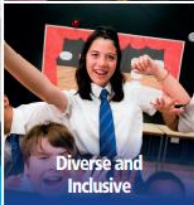
Diverse and Inclusive