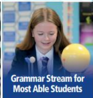
Grammar Stream for Most Able Students