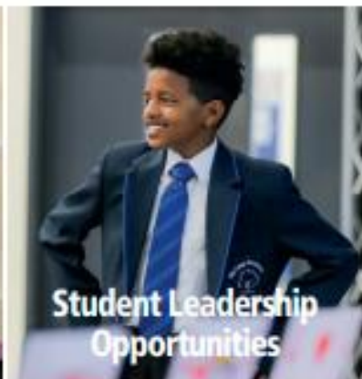
Student Leadership Opportunities