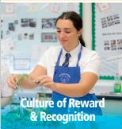
Culture of Reward & Recognition