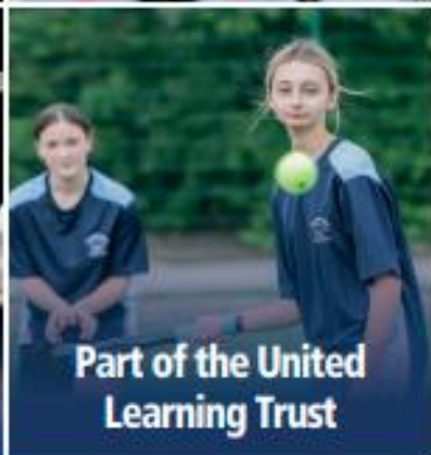
Part of the United Learning Trust