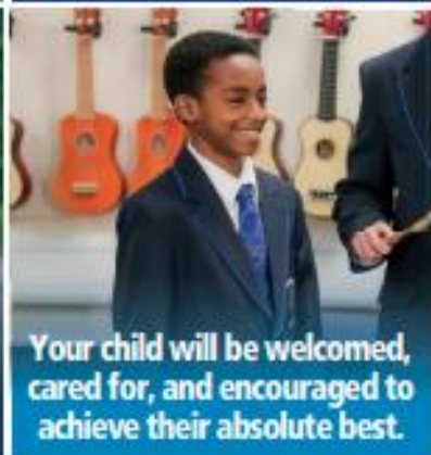
Your child will be welcomed, cared for, and encouraged to achieve their absolute best.