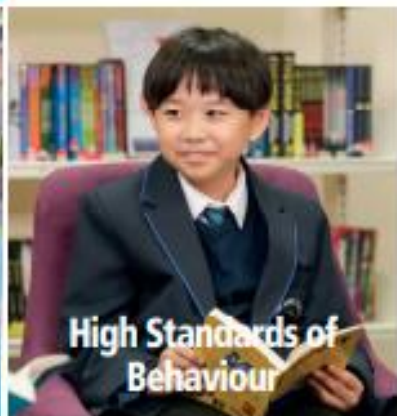
High Standards of Behaviour