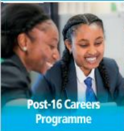
Post-16 Careers Programme